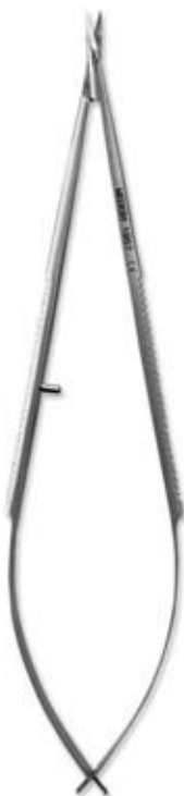
1958/C mm 155 Curved • Curva.