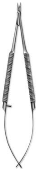
1959/R mm 150 Straight • Retta.