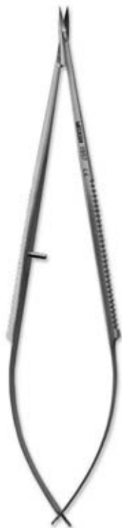
1957/R mm 155 Straight • Retta.