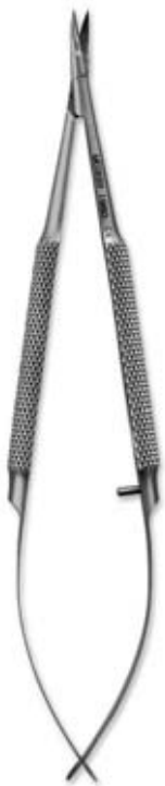
1960/C mm 150 Curved • Curva.