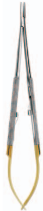
1922 CTC mm 180 Straight • Retta.